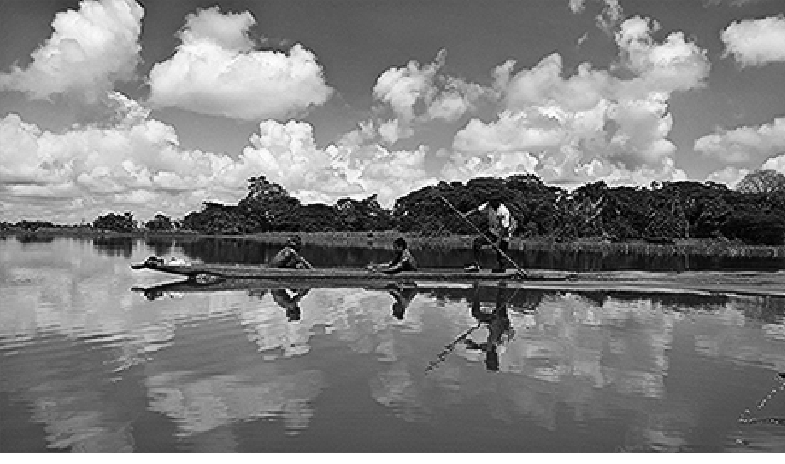
The Sepik River

The question of who needs to be consulted for FPIC to be given, when and why, is contested. PNG mining legislation places the emphasis on gaining consent of the landowners who have rights to the land where the minerals are or where project infrastructure has been built. However, many of PNG's mines rely on rivers for access, transport and tailings dispersal. Nevertheless, there has been a tendency not to consult communities downstream despite the fact that both their environment and their way of life are altered to the same extent as those communities living where the extraction happens. But the history of PNG tells us one thing for certain: if downstream communities whose land does not contain the resource but whose lives and environment will be affected by any resource are not consulted, it can result in environmental disasters and social unrest.